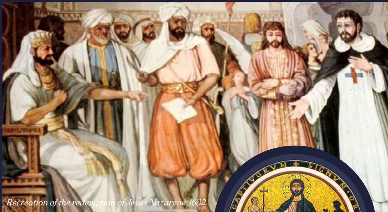
Recreation of the redemption of Jesus Nazarene, 1682