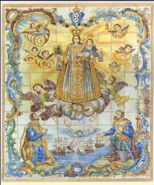
Real Convento del Rimedio of Valencia

Founding of the Convent of the Remedy in Valencia, succeeding the previous Convent of the Holy Trinity that the Poor Clares took possession of when it was suppressed for lack of religious (1444).