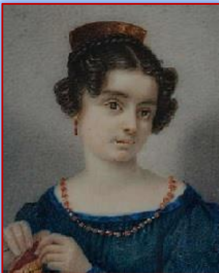
(Elisabetta Canori Mora)