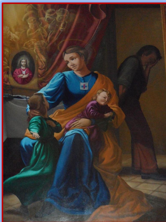
(Elisabetta Canori Mora. Oil on canvas in the Church of the Spanish Trinitarians of Naples - Italy )