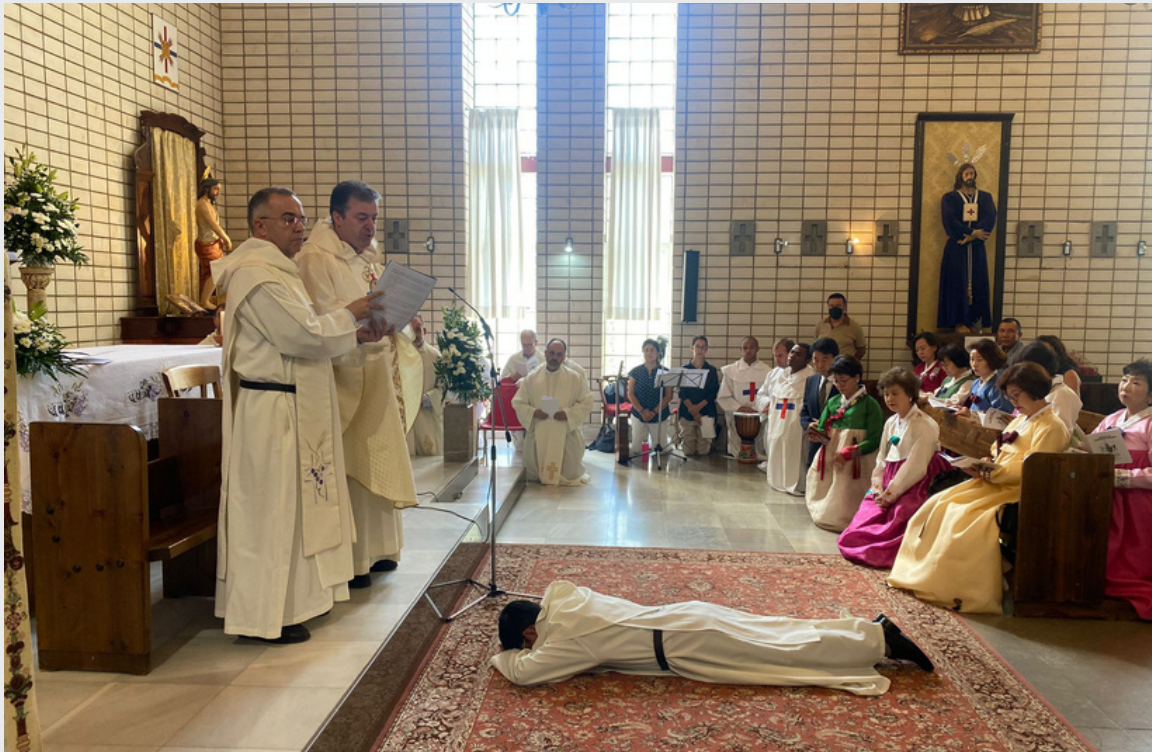
USA: Entrance of novices