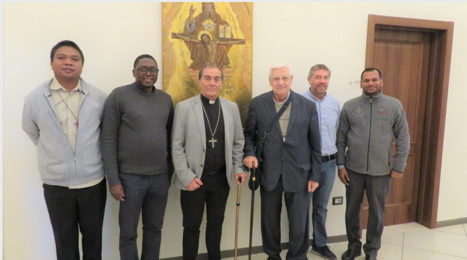
Image of Jesus Nazarene